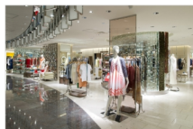
Retail chain stores