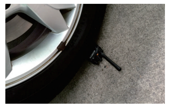
1.5 Ton Anti-pressure

Certified by CE MIL-STD-810 C/D/E/F/G Dust and water proof Class IP54 (IP56 in U.K. area)